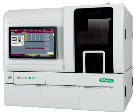
IH-500 NEXT - Fully Automated System for IH-Cards

IH-500 NEXT System, for the next generation of blood bankers.