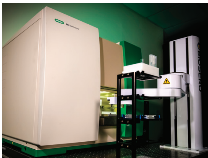
The ZE5 Cell Analyzer integrated into the Biosero Automated Plate Handling System.

The ZE5 Cell Analyzer was built for high-throughput analysis with a focus on speed, flexibility, high-parameter analysis, and automation. The integrated sample loader is able to accommodate tube racks, 96-well plates, or 384-well plates. Screening is fast, with the ability to analyze up to 100,000 events per second. In high-throughput mode, a 96-well plate can be analyzed in less than 15 minutes and a 384-well plate in less than 60 minutes. In addition to its speed, the ZE5 Cell Analyzer can accommodate up to five lasers and 30 detectors, giving it the ability to simultaneously detect 27 fluorescence parameters. Consideration for sample integrity is also built in, with temperature control and vortexing available to keep cells viable and uniform during sampling. The ZE5 Cell Analyzer features flexible capabilities for use in a wide range of applications that can be improved with high-throughput automation.